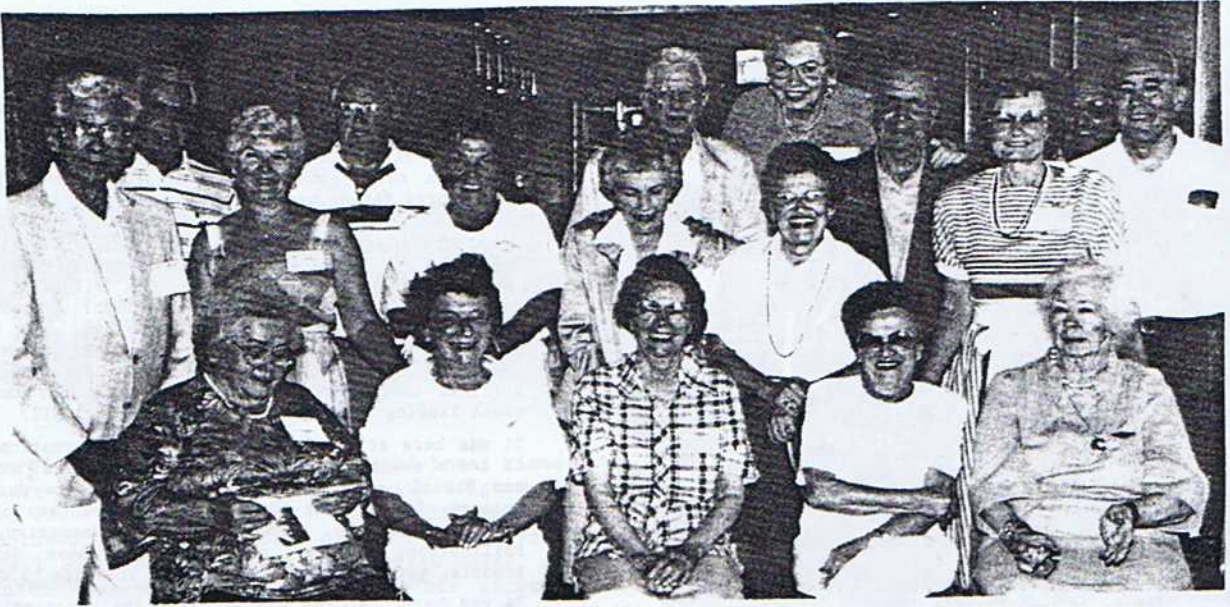
806th MED AIR EVAC SQDN, LOUISVILLE, 1992