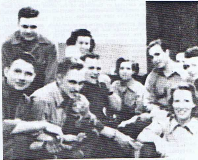
Nurses and Medics of the 815th MAES Living room of Nurses quarters at Membury.